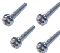
M4 x 30L Screw * 4