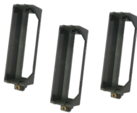
I/O Socket * 3